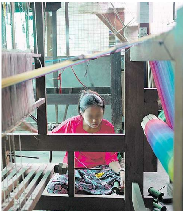
WEAVING HER FUTURE: A worker at the social enterprise FXB Myanmar making textiles.

In Yangon an organisation, FXB Myanmar, gives vocational training and business opportunities to HIV-positive workers and women rescued from the Thai sex industry. A manufacturer of affordable foot pumps for irrigation, Proximity Designs, has a network of distribution channels to upcountry farmers that NGOs and government organisations envy. BusinessKind-Myanmar sells low-cost mosquito netting in malarial and dengue fever regions, and half of its work force is also HIV-positive. Myanmar Business Executives provides low-interest microcredit and networking outlets to needy individuals and organisations.