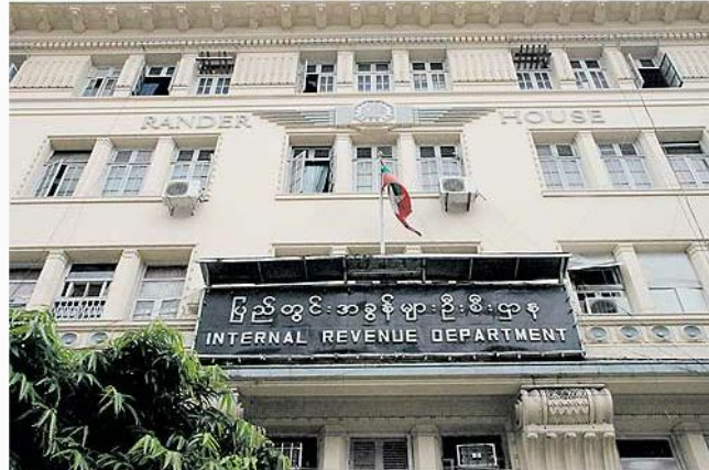
with many government offices moved to the new capital, one field excursion by the seminar considered how to use the old buildings.

Spectrum's visit to Myanmar was made possible by support from the British Council and the Asia-Europe Foundation.