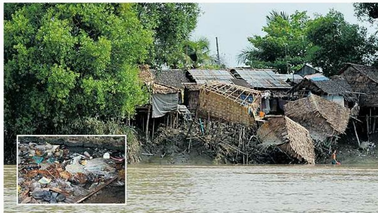
home degradation along Myanmar waterways was one of the issues looked at by the workshop. And inset, rubbish along Yangon waterways.