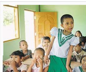
THE FUTURE IS THEIRS: Students at a class in a monastic school in Myanmar.